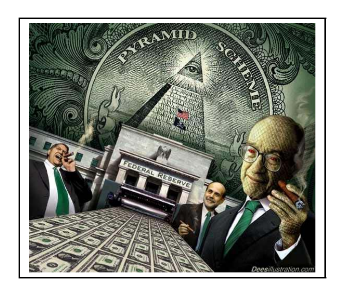
or How the Uniform Commercial Code replaced the United States Constitution!

http://www.barefootsworld.net/usfraud.html