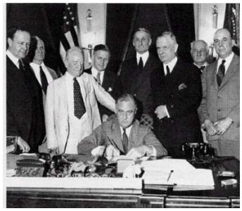
FDR confiscated the people's gold in 1933

you try to look up the 1930 minutes, you will not find them because they don't publish this particular volume. If you try to find the 1930 volume which contains the minutes of what happened, you will probably not find it. This volume has been pulled out of circulation or is hidden in the library and is very hard to find. This volume contains the evidence of the bankruptcy.